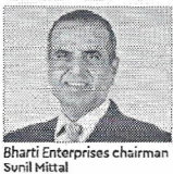
Bharti Enterprises chairman Sunil Mittal

"In India, the parties have entered into an MOU (Memorandum of Understanding) for a strategic agreement to distribute services to large enterprises, small and medium businesses, government, telcos