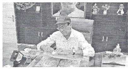
দায়িত্ব গ্রহণের পর, মালদা পুরসভার ট্যাক্স আদায়ের ক্ষেত্রে জালিয়াতির অভিযোগের তদন্ত কমিটি গঠন করা হয়েছে।

এমনকি পুরসভার ট্যাক্সের যে পরিমাণই রয়েছে, সেটিও নাটকীয় ভাবে হ্রাস করা হয়েছে।